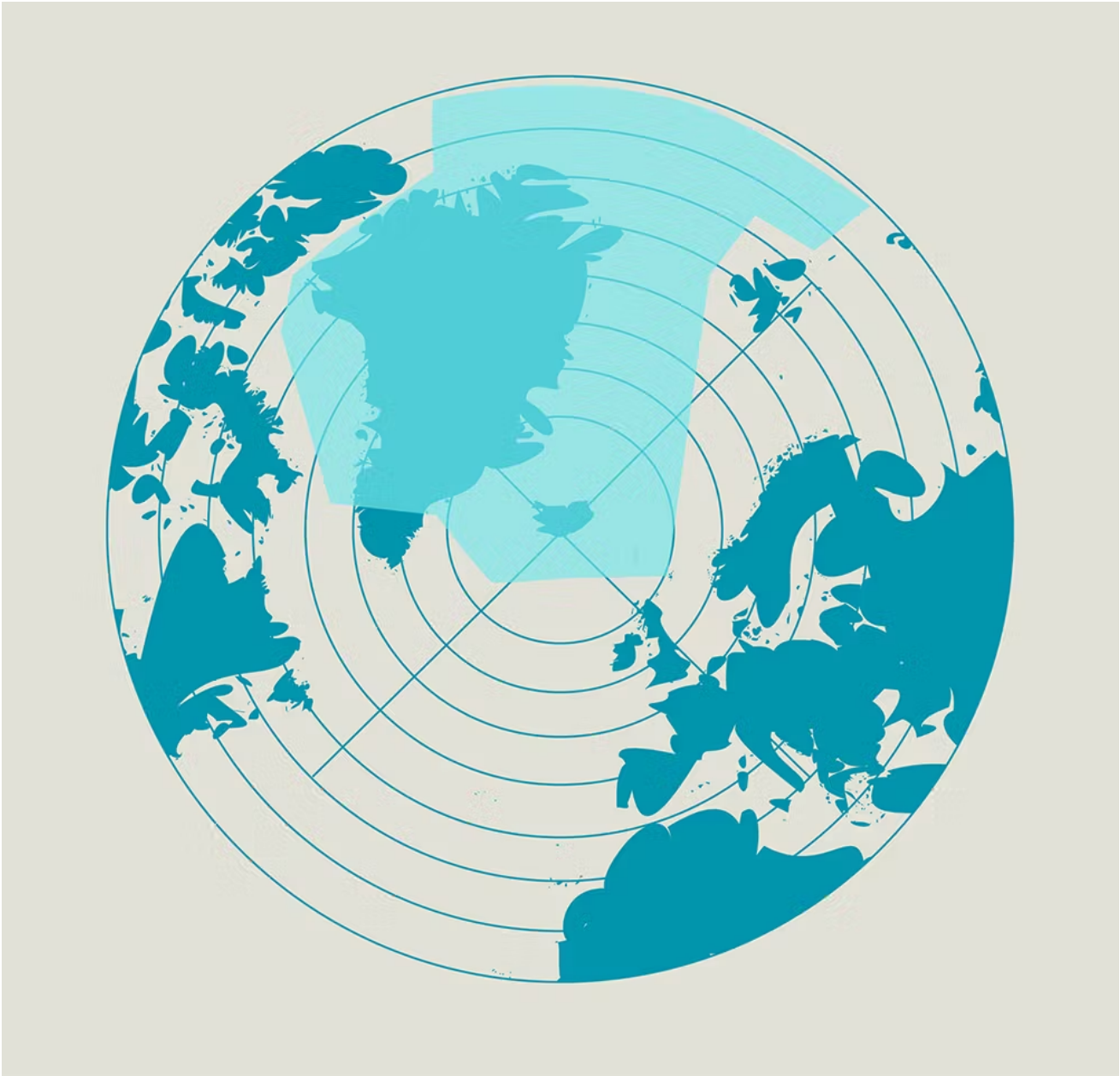
Illustration by Isavia.

The Reykjavik Control Area (BIRD CTA) covers over 5.4 million square kilometres of oceanic airspace between North America and Europe, stretching all the way to the North Pole. Under this airspace lie three territories: Iceland, Greenland and the Faroe